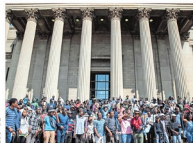
Millions of South African youth are protesting against the government's failure to create jobs. (1/10/2017)

W hat is the biggest concern of young people in South Africa? Unemployment. It is the biggest concern of young people in South Africa. It is the biggest concern of young people in South Africa. It is the biggest concern of young people in South Africa. It is the biggest concern of young people in South Africa.