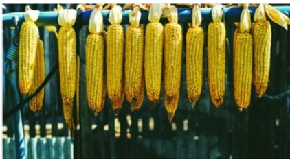
AMAZING! In Africa, South Africa is the only country to allow genetic modification of its staple foods. (1/10/2017)

In Africa, South Africa is the only country to allow genetic modification of its staple foods. Statistics reveal that an estimated 80% of white maize in GM, while 52% of yellow maize 45% of soy and 98% of cotton is GM. In 2017, South Africa introduced a genetically modified organism (GMO) regulatory law through the Genetically Modified Organisms Act, 2017 (Act No. 61 of 2017) which was intended to regulate the production and use of GMOs in a manner that safeguards human health, the environment, animals and humans.