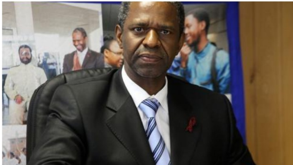
KZN Department of Health MEC, Sibongiseni Dhlomo.

DURBAN - The head of the KwaZulu-Natal health department, MEC Sibongiseni Dhlomo, has been issued with a notice to appear before the South African Human Rights Commission over the "lack of meaningful progress" in dealing with the province's oncology crisis.